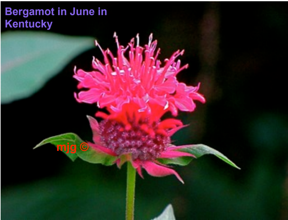
Bergamot in June in Kentucky