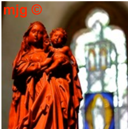
Hope came to us in the world in the form of child