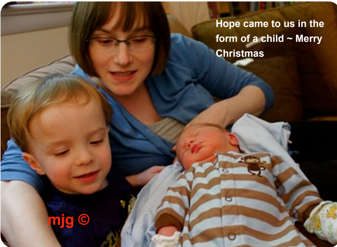
Hope came to us in the form of a child ~ Merry Christmas