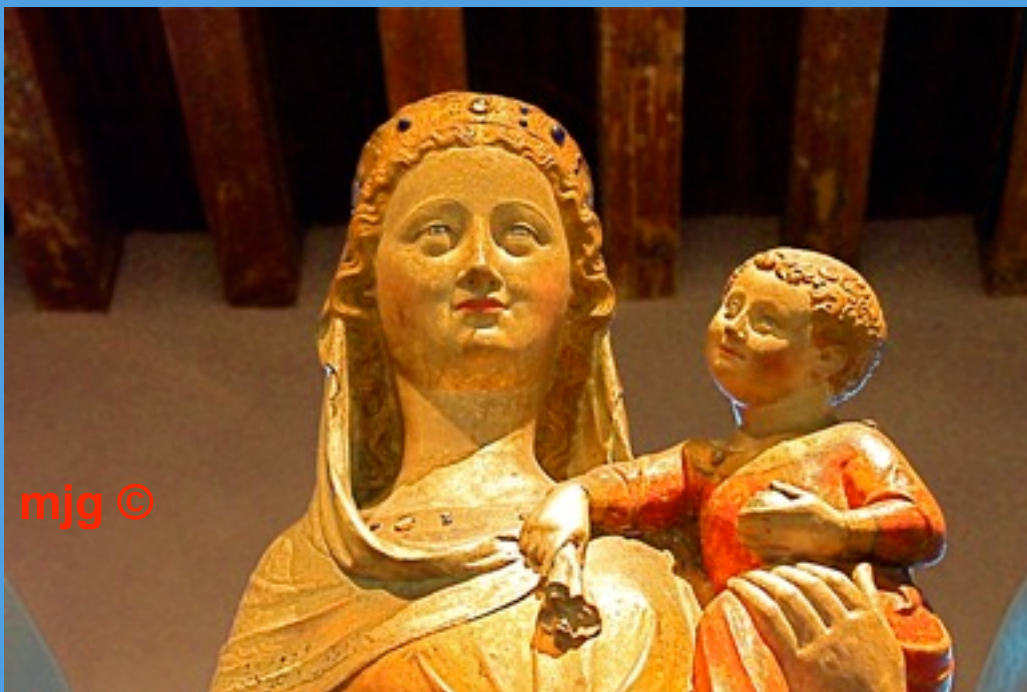
Hope came to us at Christmas in the form of a child ~ Merry Christmas

This is not a time to say that one religion is better than another because this kind of thinking doesn’t promote seeking the necessary solutions that are needed.