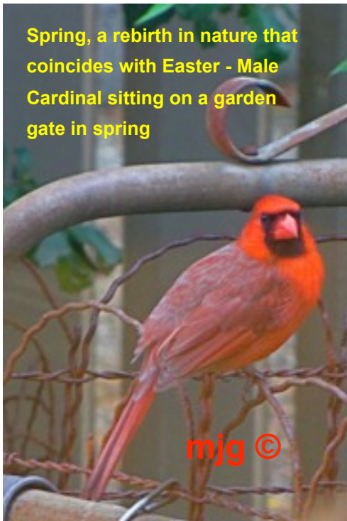
Spring, a rebirth in nature that coincides with Easter - Male Cardinal sitting on a garden gate in spring

19. The dialogue programme of the World Council of Churches (WCC) has emphasized the importance of respecting the reality of other religious