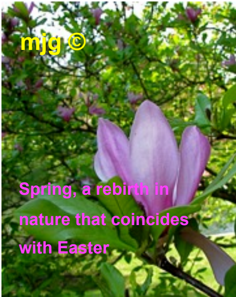
Spring, a rebirth in nature that coincides with Easter

participate in the pattern of God's redeeming love. Indeed our hospitality is not limited to those in our own community; the gospel commands us to love even our enemies and to call for blessings upon them (Matt. 5:43-48; Rom. 12:14).