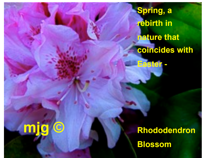
Spring, a rebirth in nature that coincides with Easter -

Practical hospitality and a welcoming attitude to strangers create the space for mutual transformation and even reconciliation.