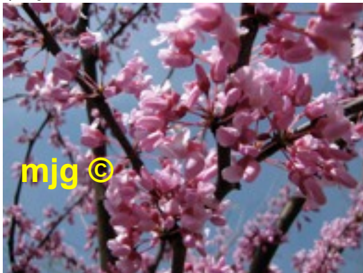
Red bud tree blossoms in spring against a blue sky

Spring, a rebirth in nature that coincides with Easter