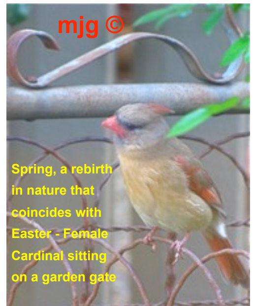
Spring, a rebirth in nature that coincides with Easter - Female Cardinal sitting on a garden gate